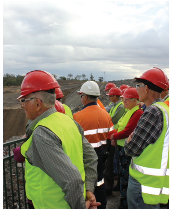
Public tour at the New Acland Coal Mine

The New Hope Group has provided further information on the revised New Acland Coal Mine Stage 3 Project Environmental Impact Statement to the Office of the Coordinator-General.