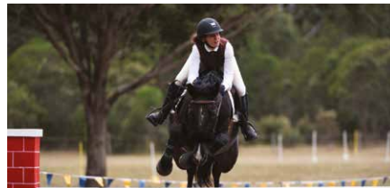
Crows Nest and District Pony Club

If you are interested in dropping by the Peranga & District Bowls Club, head down to 100 Denham Street, Peranga.