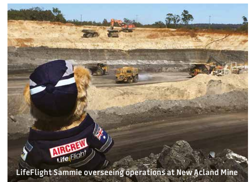
LifeFlight Sammie overseeing operations at New Acland Mine