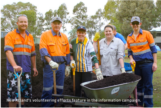
New Acland's volunteering efforts feature in the information campaign.