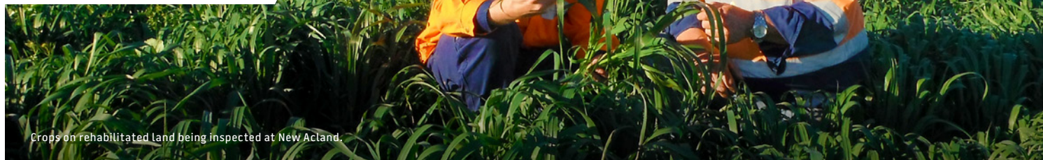
Crops on rehabilitated land being inspected at New Acland.