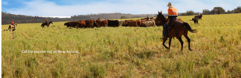
Cattle mustering at New Acland.

Independent livestock consultancy Outcross and the University of Southern Queensland are working with the Acland Pastoral Company on the new trials.