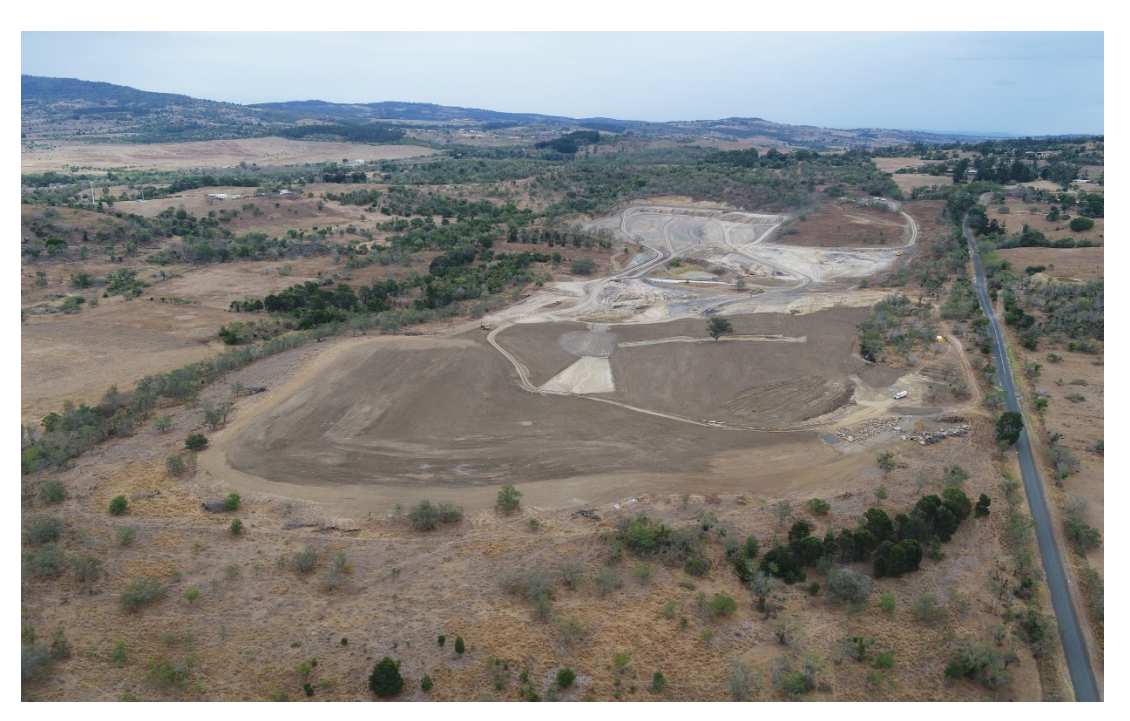
Normanton pit rehabilitation works is continuing at the New Oakleigh site.

The southern area of this project has now been completed with the area seeded to pasture and awaiting anticipated rain.