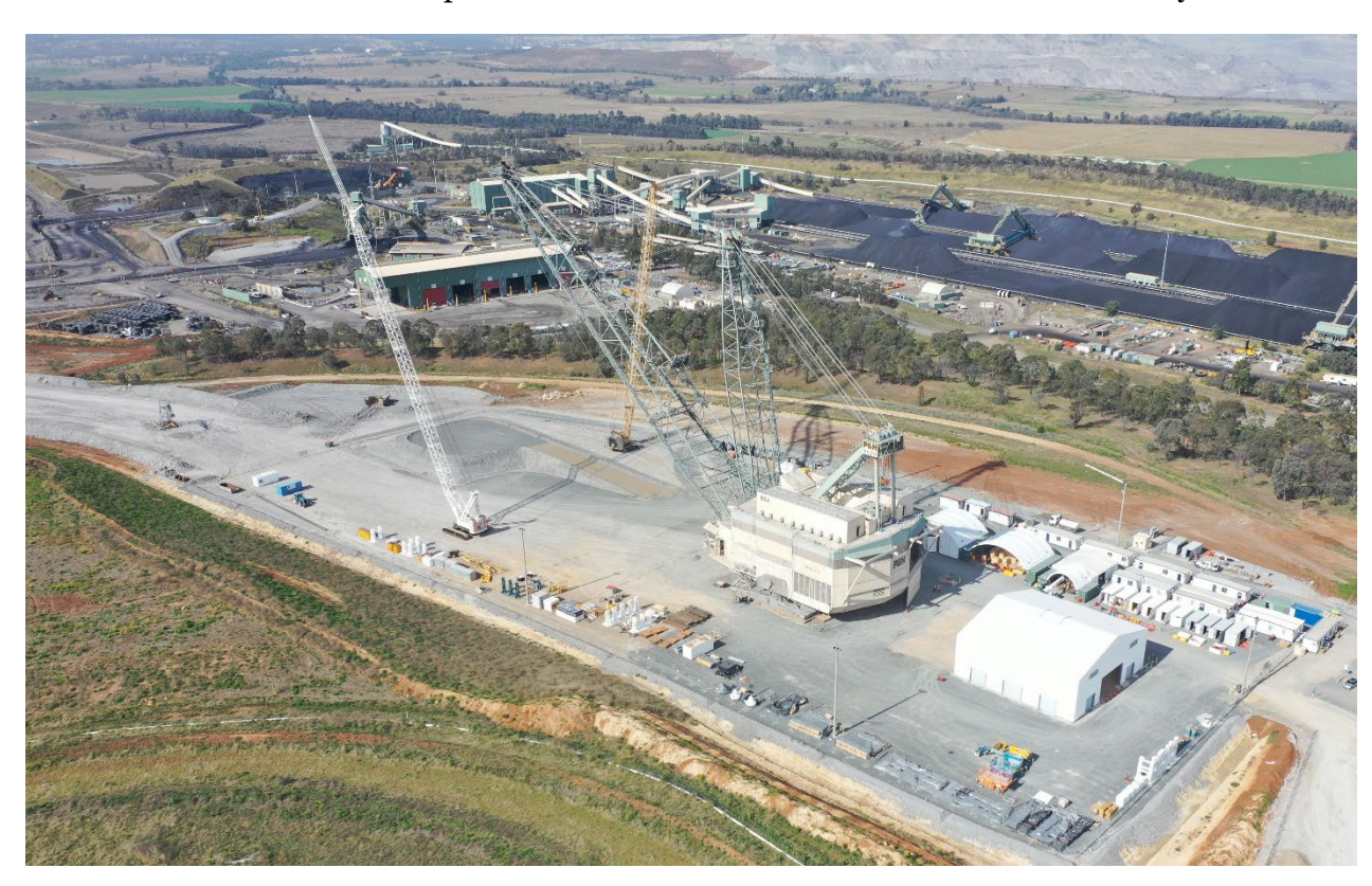
Aerial view of the Bengalla dragline under maintenance.

The dragline accounts for around 20% of total waste material movement at Bengalla and the shutdown will have a minor impact on coal flow in the first half of the 2021 financial year.