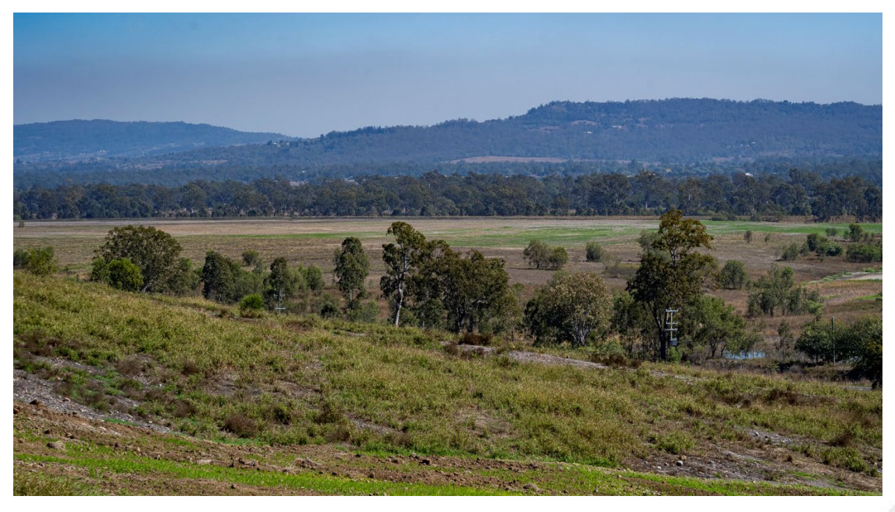
Jeebropilly rehabilitation eight months after operations ceased.

West Moreton Operations' major focus continues to be on rehabilitation activities at the Jeebropilly and New Oakleigh sites. Re-shaping, topsoil placement and pasture seeding has continued over the quarter along with capping of the most southern area of the tailing storage facility.