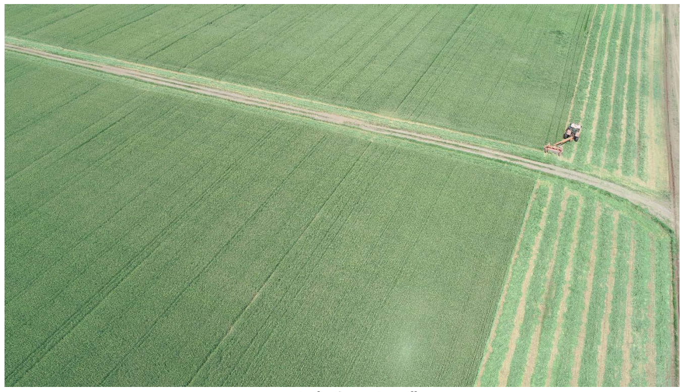
Barley Crop at Bengalla

Following the acquisition of a controlling interest in Bengalla, New Hope's land management experience is being applied to the active management of agricultural land surrounding the Bengalla operation. Twenty six hectares of barley was planted under the newly installed lateral irrigator, with harvesting planned for late October.