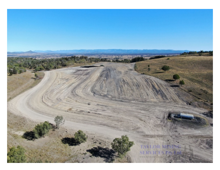
Oakleigh East showing ongoing rehabilitation and capping of a tailings dam area. Images taken from the north-east by Taylor Mining Services Pty Ltd

Oakleigh East rehabilitation activities have continued with the capping of a remnant tailings dam completed and an initiation of works to restore the cut/fill balance in line with other areas of the site.