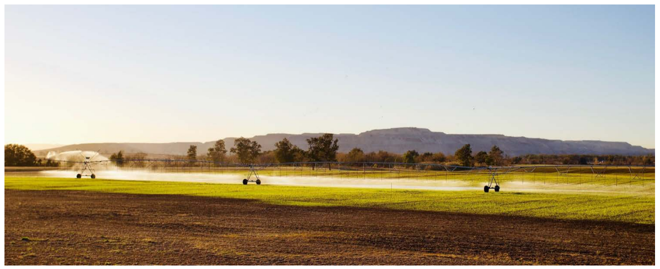
Growing oats at Bengalla

Following the acquisition of a controlling interest in Bengalla, New Hope's land management experience is being applied to the active management of agricultural land surrounding the Bengalla operation.