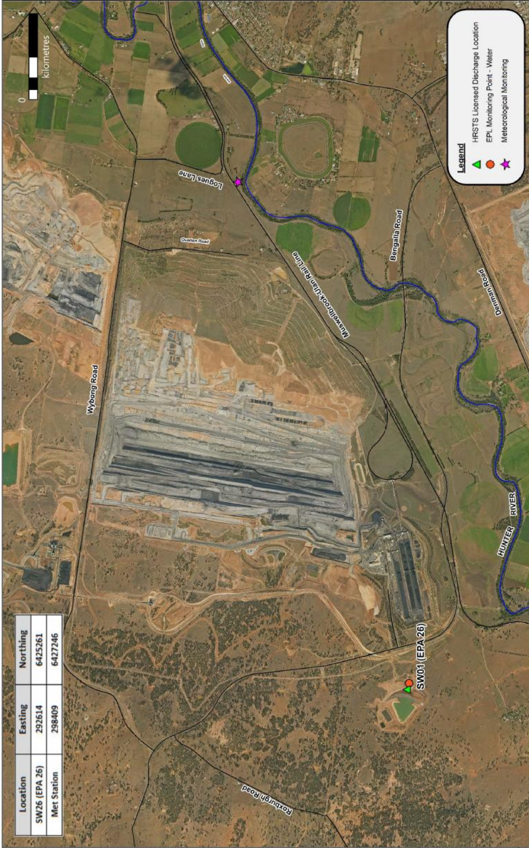
Bengalla Mine EPL 6538 Monitoring Points - Water 23/07/2020 Rev A

Aerial photo captured 22/01/2020 Coordinates are approximate only Coordinate system MGA zone 56 GDA 94