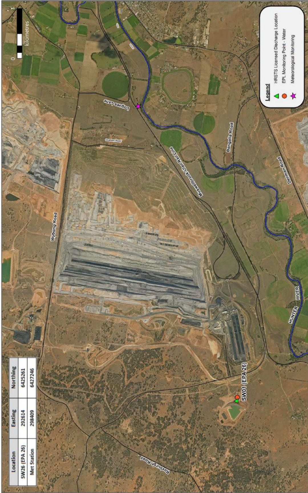
Bengalla Mine EPL 6538 Monitoring Points - Water 23/07/2020 Rev A

Aerial photo captured 22/01/2020 Coordinates are approximate only Coordinate system MGA zone 56 GDA 94