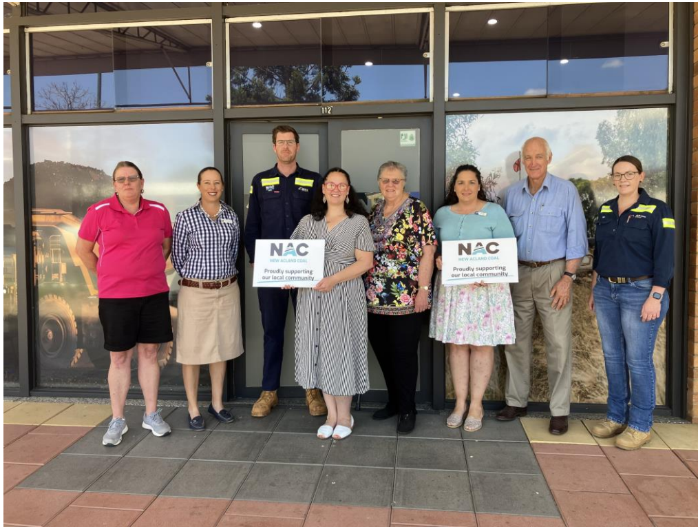
(NAC CIF September recipients)