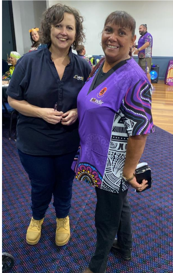
(NAC Community Liaison Officer with Goondir Acting Clinic Manager at 2023 Elders Luncheon)