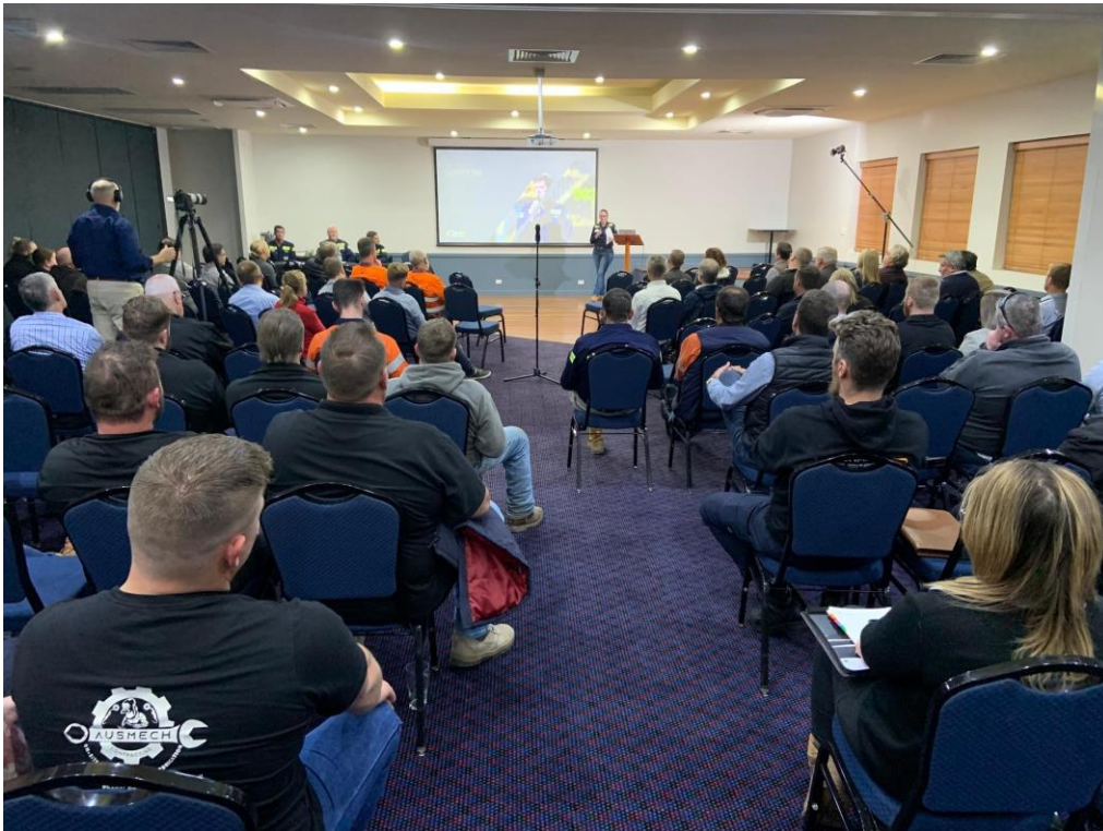
(Project Engagement and Tender Training Session)