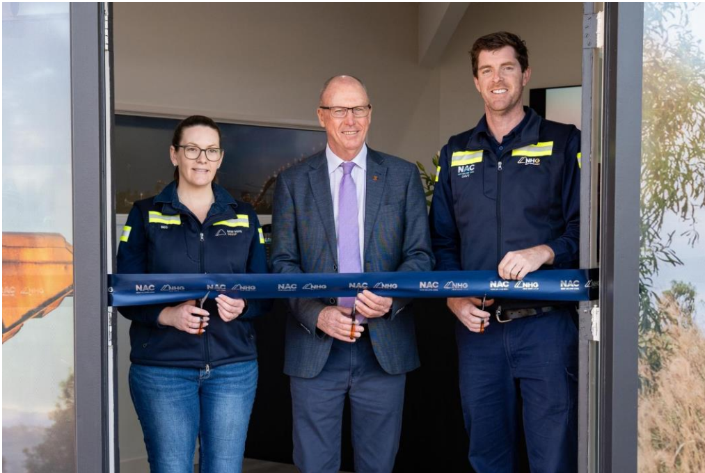
(Opening of NAC Community Information Centre, Oakey)