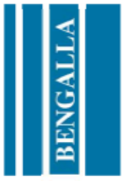
BENGALLA MINE Depositional Dust Monitoring Locations

PR31060_BengallaMineNSW_50cm_19102017_gda94mgas6_ortho_full-area