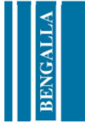
BENGALLA MINE PM10 Monitoring Locations

PRJ31060_BengallaMineNSW_50cm_19102017_gda94mgas6_ortho_full-area