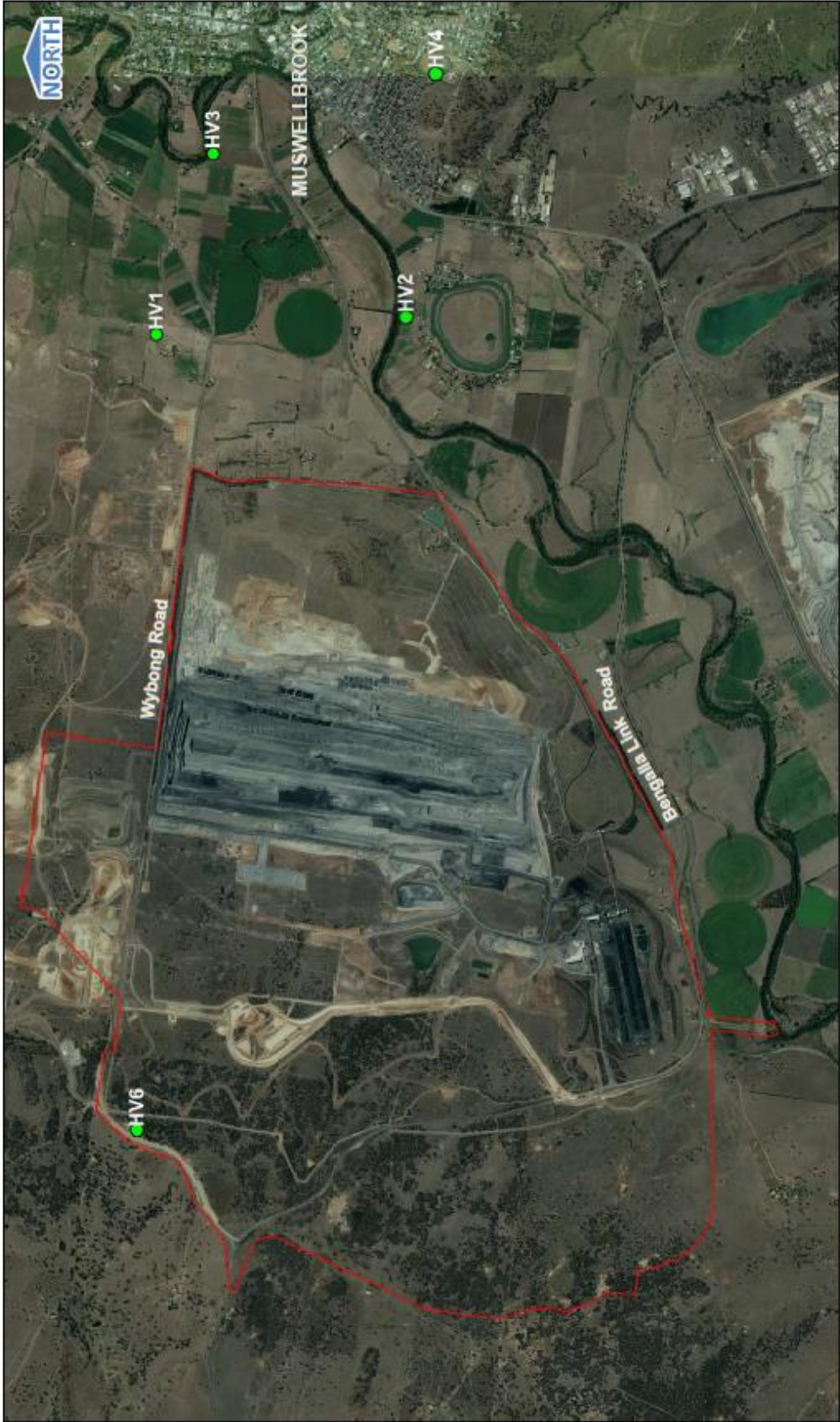
BENGALLA MINE TSP Monitoring Locations