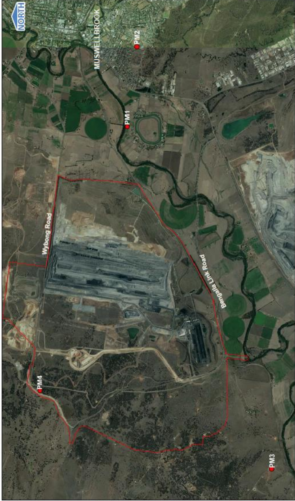
BENGALLA MINE PM10 Monitoring Locations