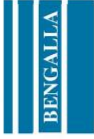
BENGALLA MINE PM10 Monitoring Locations