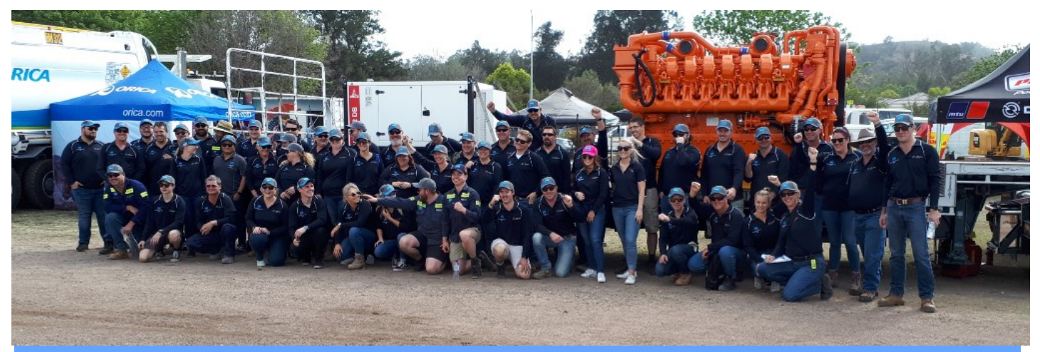
The minutes and presentations from CCC meetings are available for public viewing at the Muswellbrook and Denman Libraries. If you have an interest in any of the topics discussed at the CCC and would like further information on this topic or in future newsletters, please contact one of the members listed below.

On the 26th October, in very windy condition, we hosted our Bengalla Community Open Day at the showground. With great support form our suppliers and community partners, a large crowd attended on the day and were treated to a huge array of activities such as kids activities including face painting to a virtual reality simulator and truck, engines and machinery. The guided bus trips to Bengalla Mine were also popular with 17 buses touring the mine site including the pit and the CHPP and driving past the Bengalla agricultural land where the has been lots of work done in recent times including fencing and baling of our first crop of barley. The whole Bengalla team took great pride in preparing for the day and having the opportunity to share their knowledge and make the day a success.